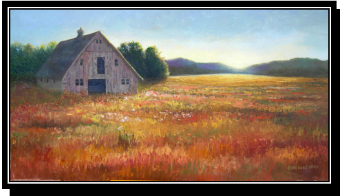
A New Day, 12 x 24, Oil on Linen © Pat Aubé Gray