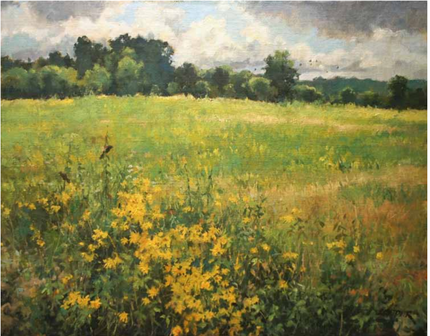
September Fields, oil on linen on board. 18x24

I spent a good part of a day on this painting. I went to Austintown Park and set up on the edge of their naturalized grassland habitat. To avoid a “too wet” surface that wouldn’t leave room for adjustments, I worked with very thin paint for much of the time and only in the last hour did I use a thicker paint application. The sun was a challenge and I had to adjust my umbrella numerous times.