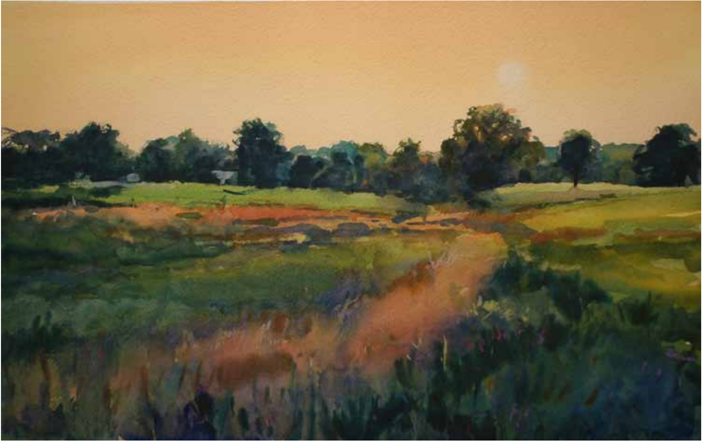
Evening Fields, 15x22, watercolor on 300 lb., cold-pressed, Arches paper

This was the first watercolor I had done in a couple months. The subject is the Mill Creek Metro Farm in Canfield. I liked the subtle colors as the sun was setting. I used Winsor & Newton blending medium in the sky. It helps even out wet into wet washes. If you are a “wet” watercolor painter you might want to try it.