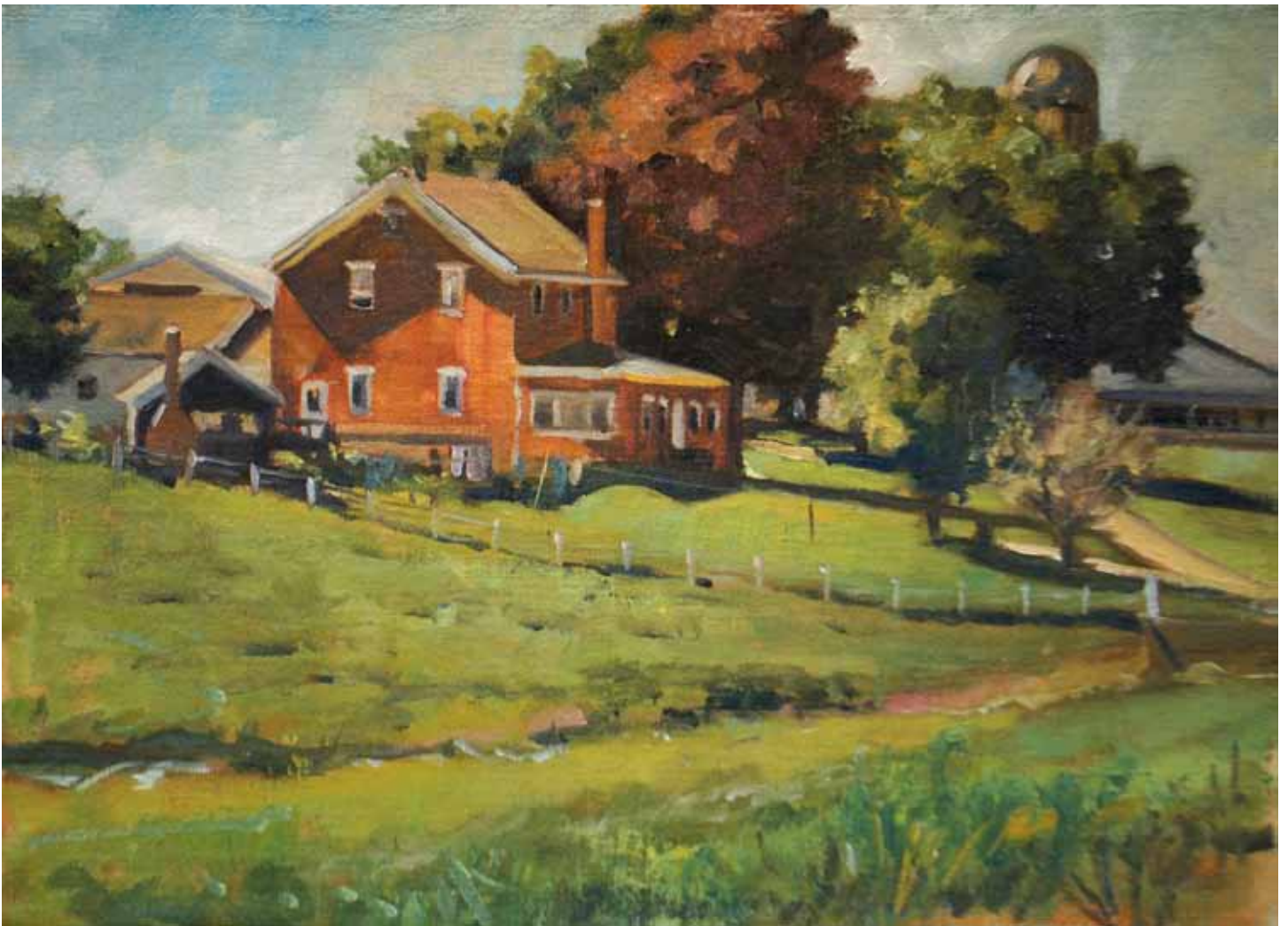
Rhodes Farm, oil on linen on board, 11x14