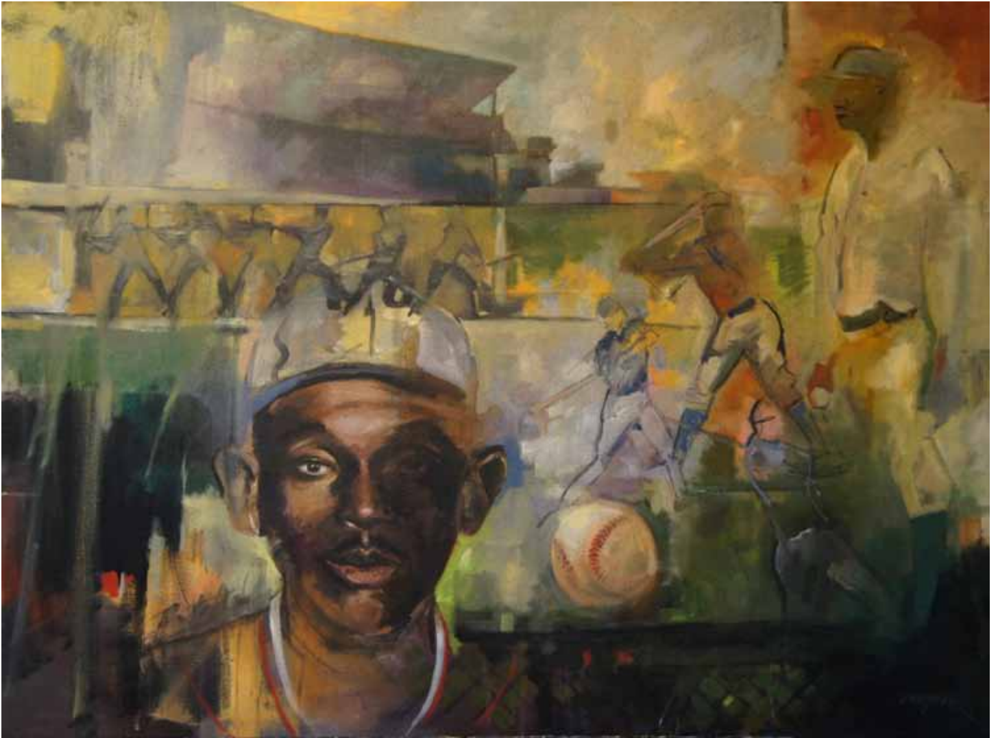
Myths and Legends, oil on canvas, 30x40