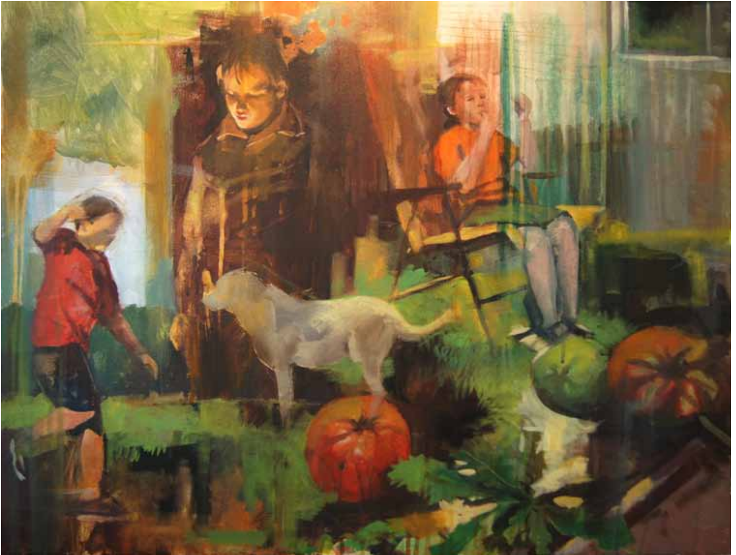
Summer Song, acrylic on canvas, 30x36