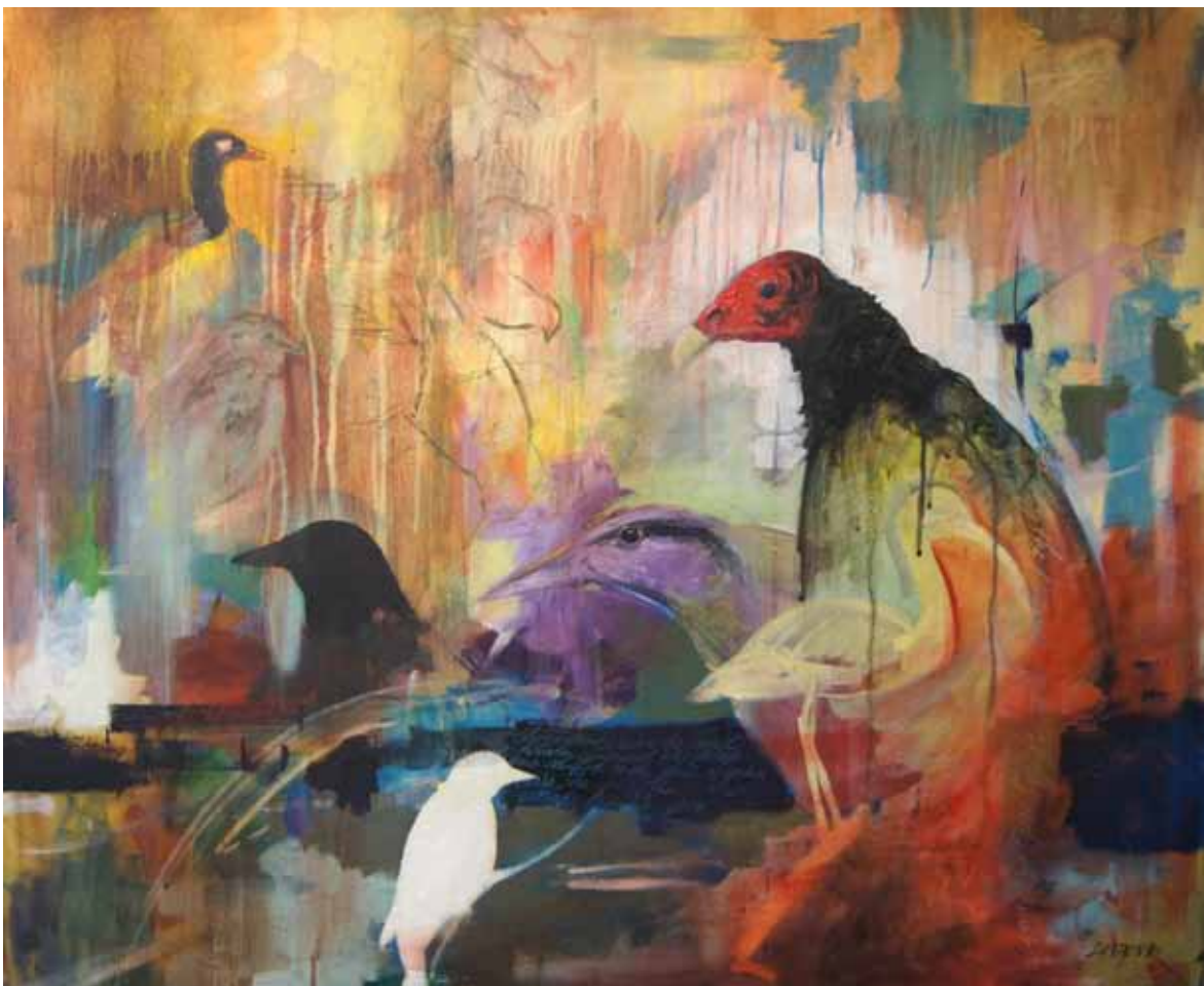
Birdcraft, acrylic, 30x36

The day after I returned home I started a new painting. My sons hearing my story and concept were totally into the idea. We chose a theme (birds) and I worked intuitively-adding and subtracting and building into a final composition. The boys gave suggestions and even helped paint sections. It was the most fun I think I had ever had doing a painting. Birdcraft was the painting. Conceptually, I was thinking of the contrast of how the general public perceives birds and how birders see our avian world. For birders it is all about specifics and details. The public sees practically nothing in comparison.. I have been an avid birder since I was young and have always been irritated when someone calls a Northern Cardinal a redbird or a Blue Jay a bluebird. Birds emerge in and out of the space showing various levels of recognition. I included a bit of writing based on a 19th century account of an immigrant family who ate a Turkey Vulture and all became deathly ill. The story amused me so I included it. The title comes from an early 20th century birding book.