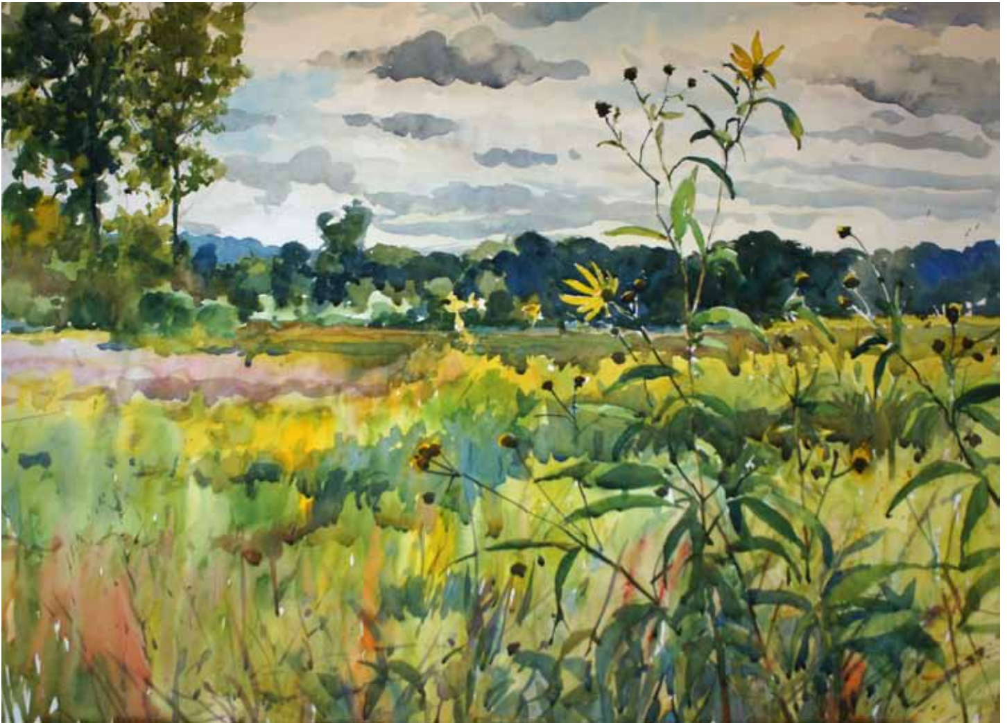
September at the Preserve, 22x30, watercolor on Twin Rocker 200 lb. cold-pressed paper

This was an indulgence. I just wanted to do a large plein air watercolor. I set up in the Mill Creek Preserve. This is one of my favorite places to walk. It is a naturalized grassland that was a former turf farm. It is a good place to see wildlife and to do some serious sky watching. My sons call it Tickville because they are a nuisance in the spring and summer when we hike there.