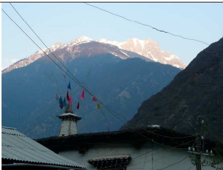
View of Meili Snow Mountain from the house. Meili Snow Mountain is considered holy by the Tibetans who make a pilgrimage around the mountain (which is several peaks) every year.