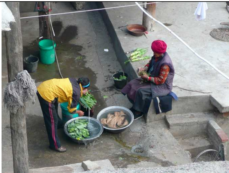
Grandma and daughter-in-law preparing vegetables from the garden for dinner.