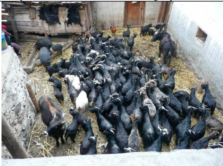
Goats, cows, pigs and chickens live on the ground floor of the house and courtyard.