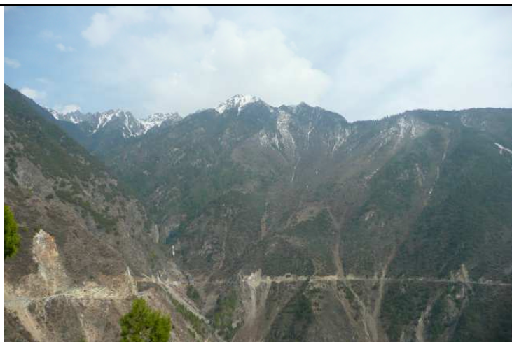
Road to the village along the Lacang River (Mekong), a basically one lane gravel road that drops about 2000 feet straight down to the river.