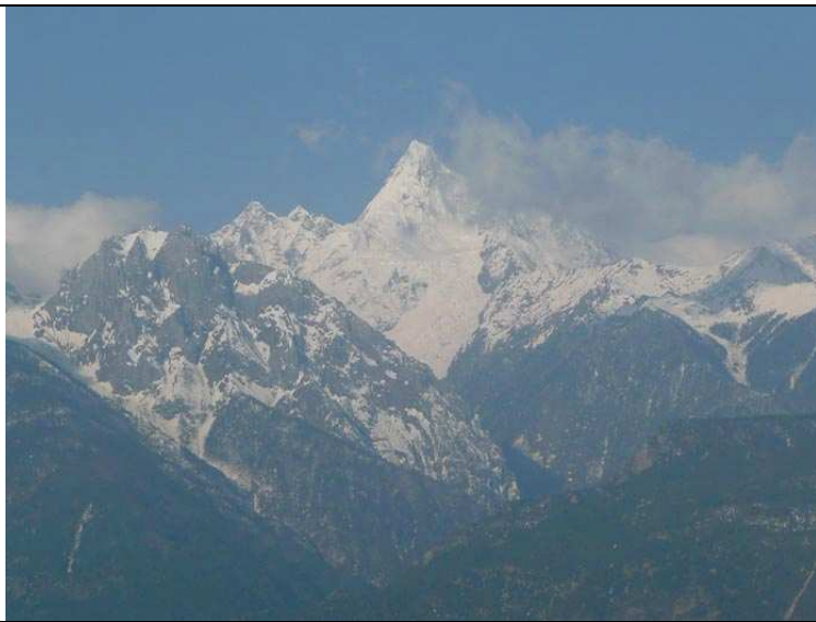
Main peak of Meili Snow Mountain from the road out of Deqin.