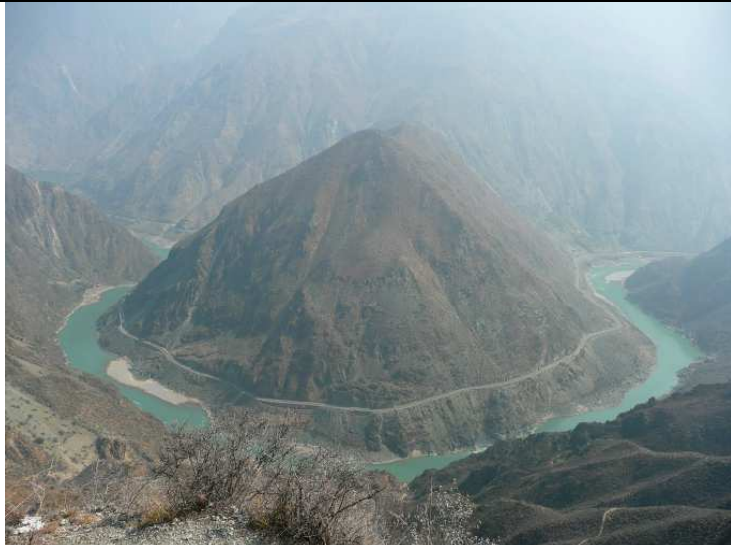
Great bend in the Yangtze River on the way to Deqin.