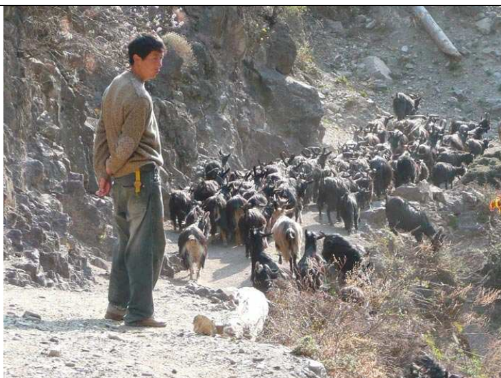
Bringing in the goats.