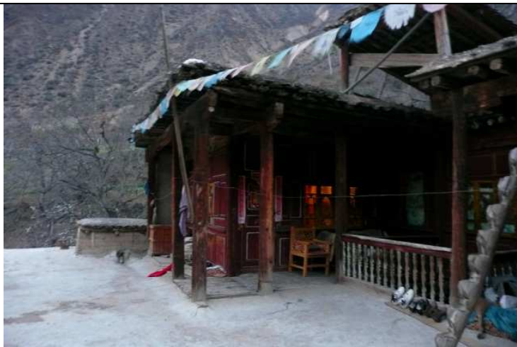
We were given bedrooms that opened onto the roof of the house.