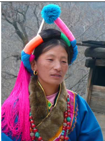
One of our models.