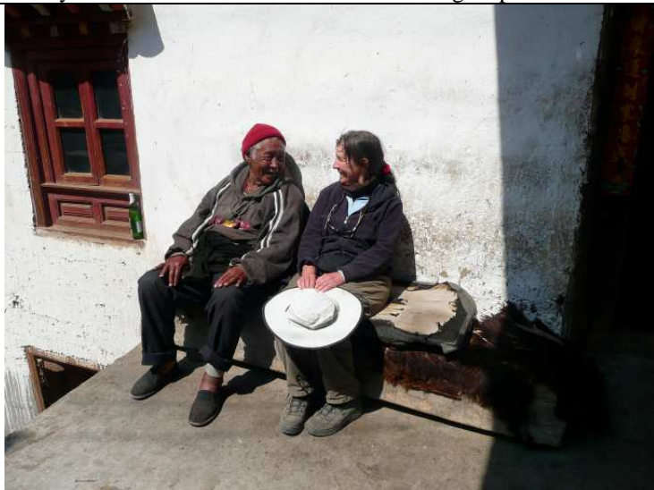
Sitting outside the house with one of the grandfathers of the Tibetan family.