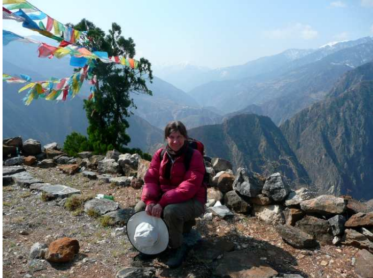
Top of the knoll seen in the above photo.