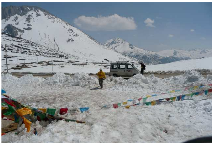
15,000 foot pass between Zhongdian (Shangrila) and Deqin.