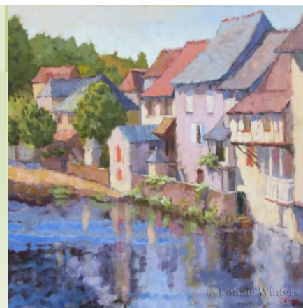
Village de La Riviere