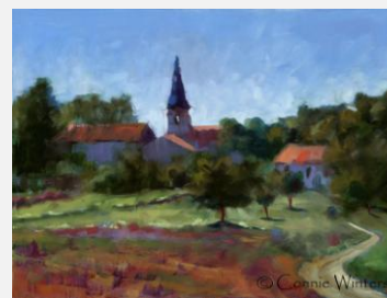
Road to Hamlet 8" x 10"