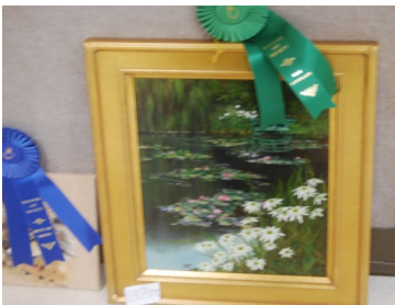
Best Landscape by Susan Tsai Monet's Garden